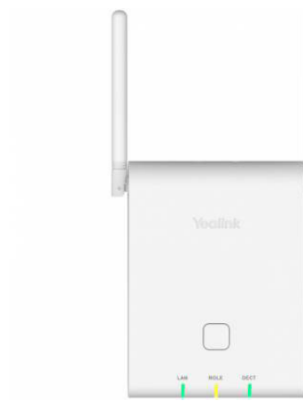
DECT IP Multi-Cell Base Station W90B