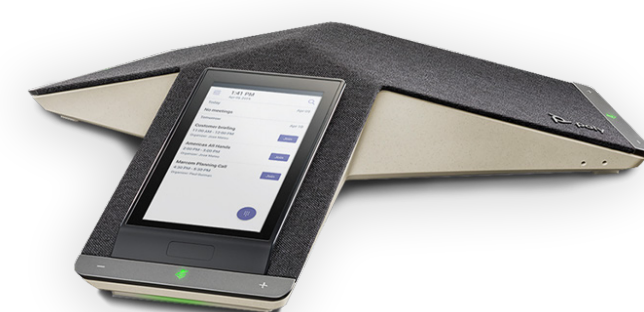
Poly Trio C60